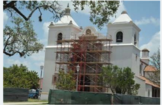
Base chapel on Randolph Air Force Base (U.S. Air Force photo/Airman Alexis Siekert) (released)